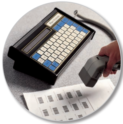
Keypad Hardware Add-on

Each day, employees can review their daily timesheet and either accept, edit or note necessary changes before posting them to the Job Costing module.